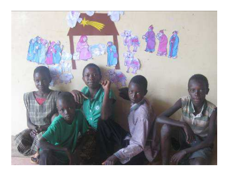
Manger from coloured paper

Lift up your heads, you gates; be lifted up, you ancient doors, that the King of glory may come in.