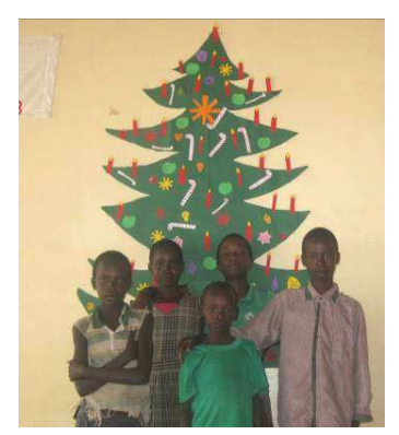
Christmas Tree from coloured paper