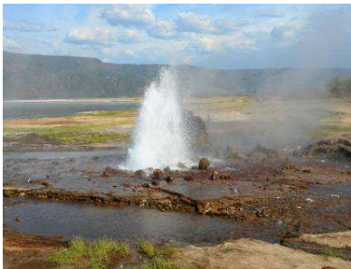
„Hot Springs“ (5kmfar from Kapkuikui)

The Lord has done this, and it is marvellous in our eyes. The Lord has done it this very day; let us rejoice today and be glad.