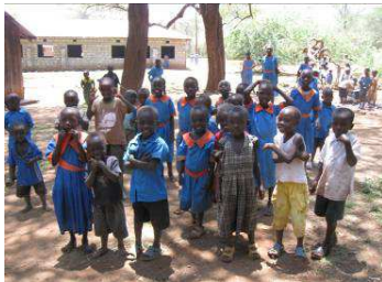
Primary Children at Kapkuikui

In Kenya the government is supporting a mission outreach at the schools. Therefore we want to evangelize at the local primary and secondary schools. At the secondary schools they like to watch movies. Therefore it would be a good possibility to show them movies in the evenings.