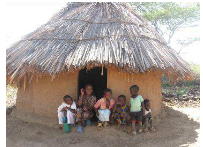
Traditional House in Kapkuikui