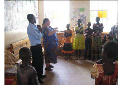
Sunday School at Kapkuikui

So we will visit those groups and see how we can help the best. We want to teach songs to the children and on Saturday afternoons we want to make a missionary outreach together with them in the local villages.