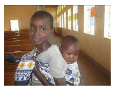
Older siblings are responsible for their younger siblings.